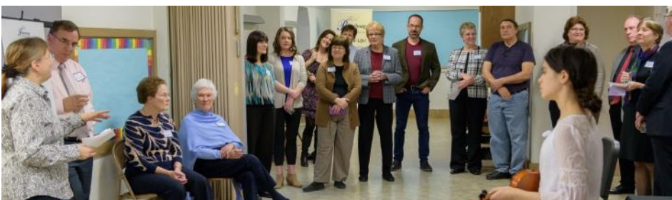
Above (Row 3): Paving the Road Forward