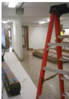
3rd Floor Build Out

Above: Day One, build out for third floor, transforming two rambling spaces into four studios and waiting area. New lighting, refreshed bathrooms