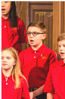
Above: Members of the Worcester Children's Chorus Sing for First Night Worcester.