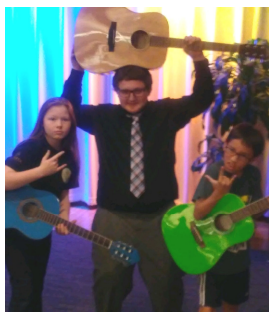
Pak@TheClub continues this spring with guitar lessons at the Boys & Girls Club. Here, three industrious students celebrate following their performance at the B&G Annual Meeting.